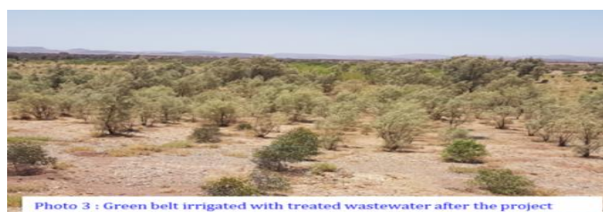
Photo 3 : Green belt irrigated with treated wastewater after the project