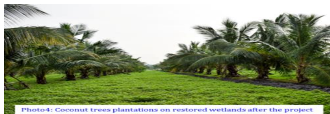
Photo 4: Coconut trees plantations on restored wetlands after the project