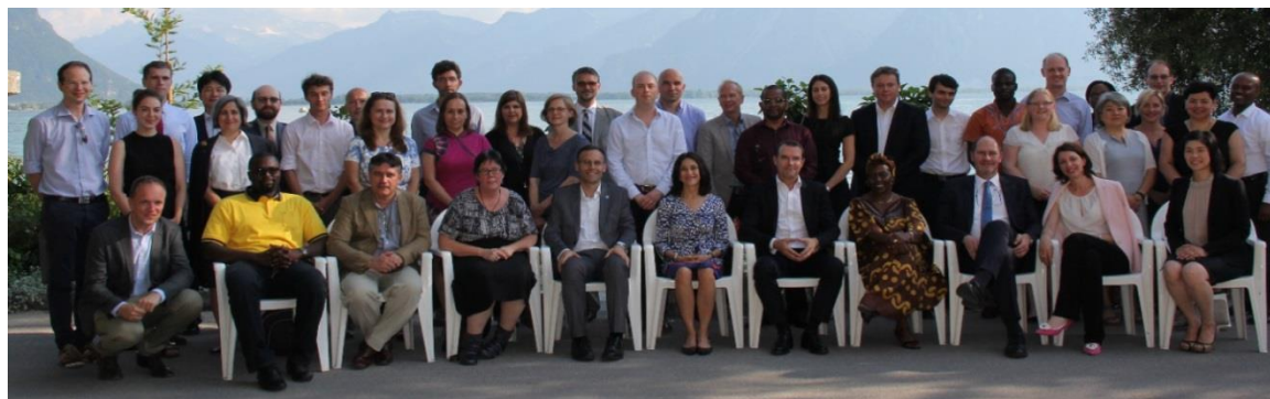
8 th Meeting of the InforMEA the Steering Committee in Montreux, Switzerland in June 2017

Five additional courses were launched on the InforMEA E-learning tool , with the “Introduction to Human Rights and the Environment” 36 generating particular interest. Registered users from 195 countries grew from about 2,000 to over 10,000. A number of universities around the world, including the Mount Kenya University (Kenya), the Macquarie University (Sydney, Australia), and University of British Columbia (Canada) have integrated the courses into reading lists and curricular of environmental law courses or programs.